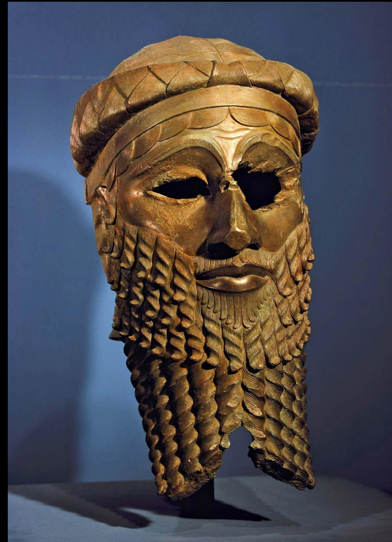
Sargon of Akkad