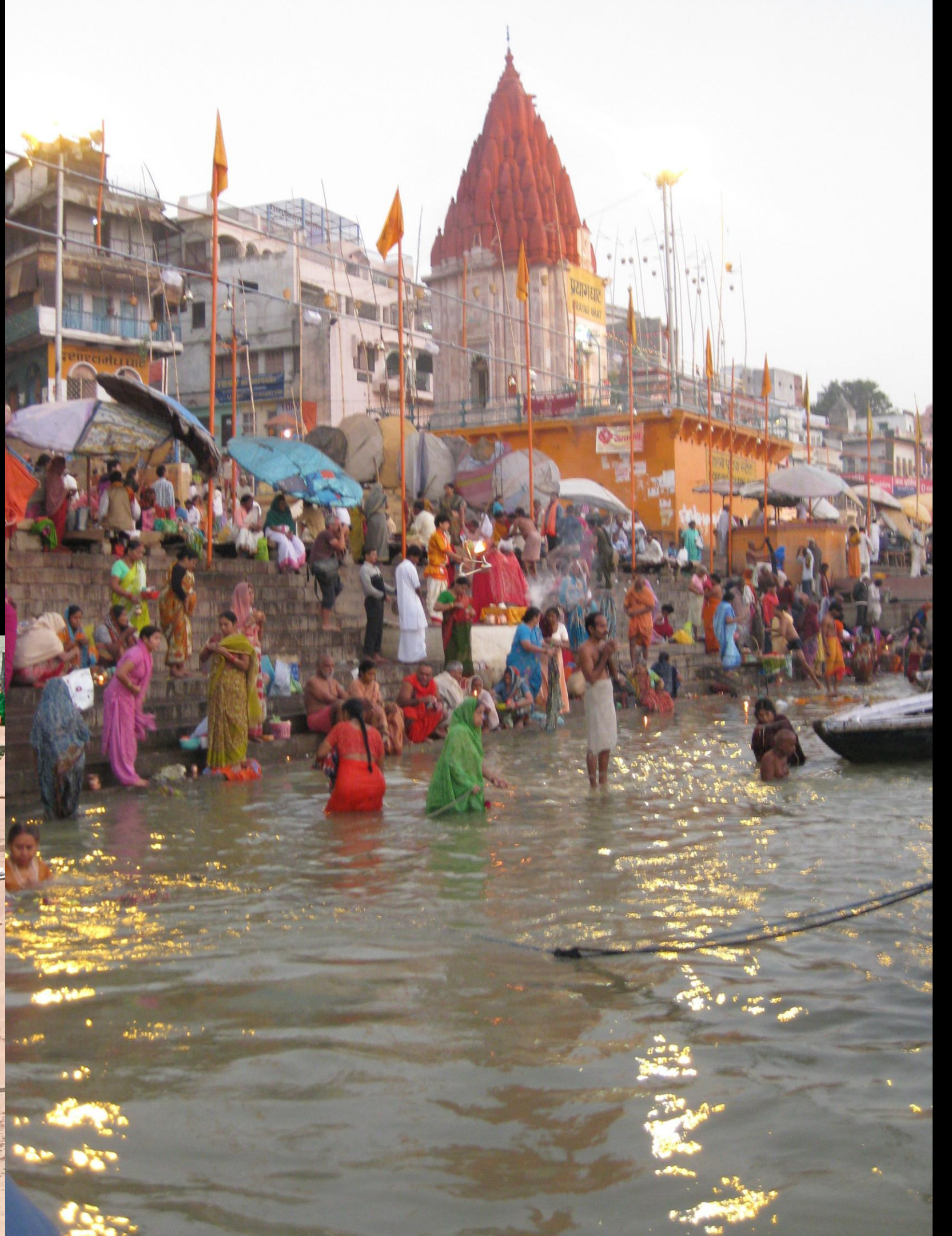
Hindu Ritual Washing in the Ganges at the Varinasi ghats.