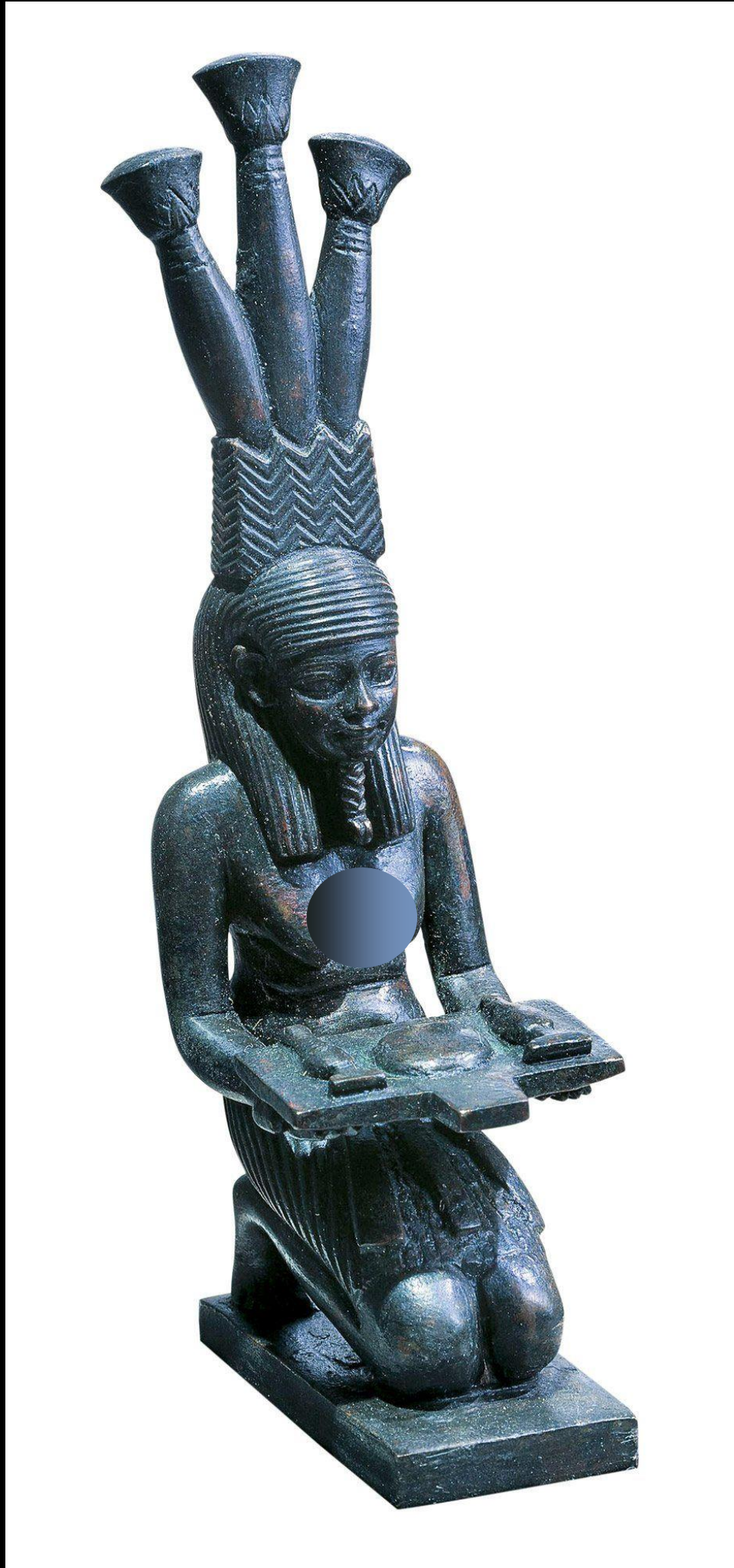
“Hapi” (Nile God)