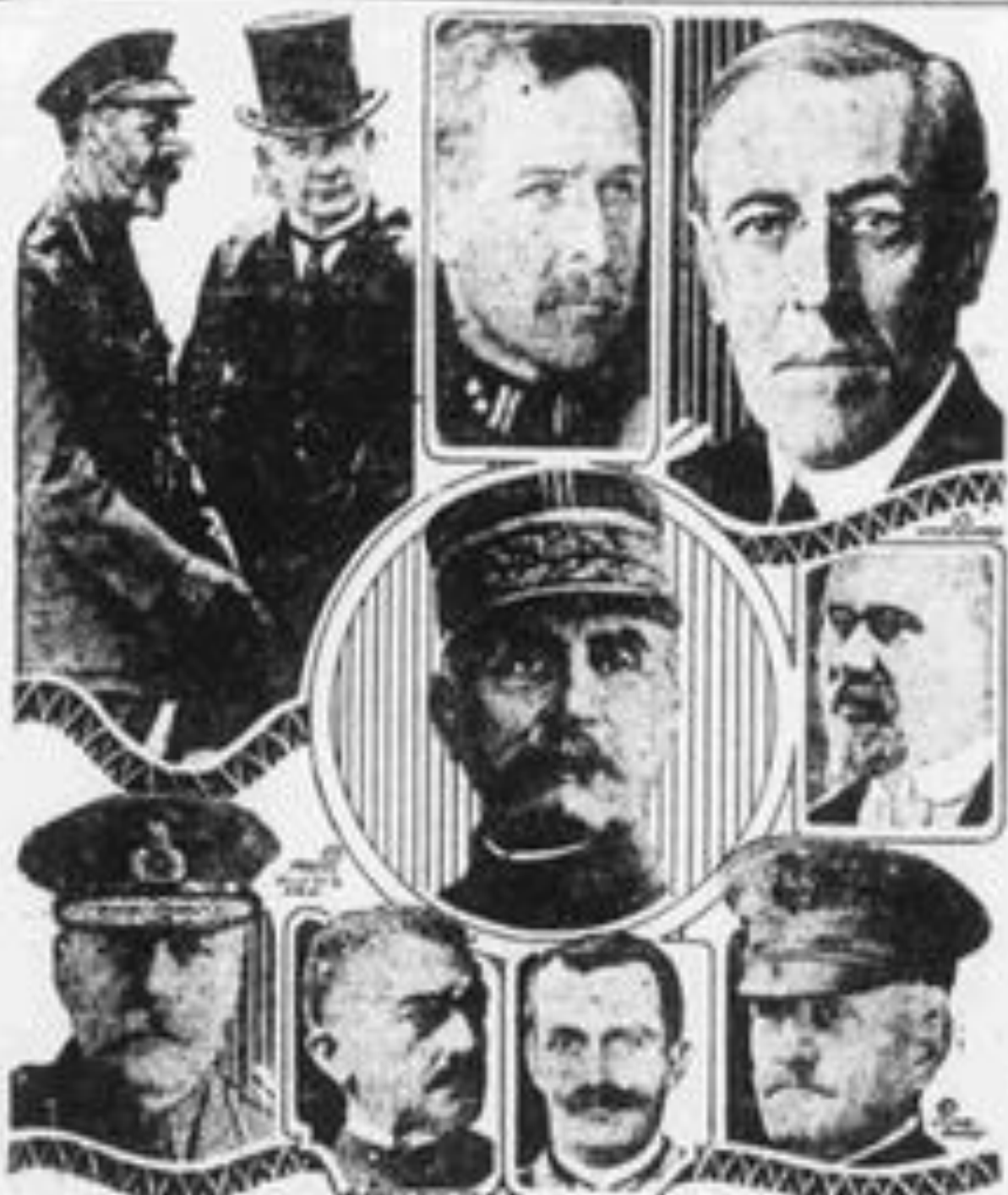
The principal military and civilian leaders of the allies in the world war. Top row, left to right, Woodrow Wilson, President of the United States; Georges Clemenceau, Premier of France; and David Lloyd George, Prime Minister of Great Britain. Middle row, left to right, General Pershing, Commander of the American Expeditionary Force; and General Foch, Commander of the Allied Armies. Bottom row, left to right, General Haig, Commander of the British Expeditionary Force; and General Pétain, Commander of the French Expeditionary Force.

Rout of Hun Armies Continues With Allies in Swift Pursuit