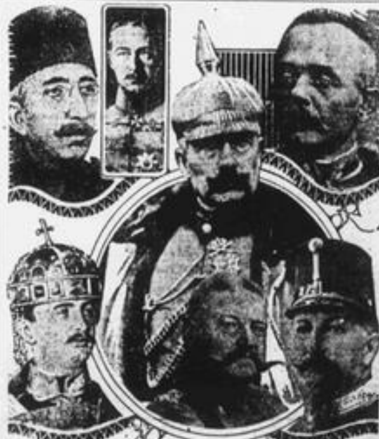
These men led the attempt to slave the entire world under the Prussian yoke. Top row, left to right, Kaiser Wilhelm II, Emperor of Germany; Emperor Frederick III, Emperor of Germany; and Emperor William I, Emperor of Germany. Middle row, left to right, Emperor William II, Emperor of Germany; Emperor William III, Emperor of Germany; and Emperor William IV, Emperor of Germany. Bottom row, left to right, Emperor William V, Emperor of Germany; Emperor William VI, Emperor of Germany; and Emperor William VII, Emperor of Germany.

Revolution Sweeps All Germany as William Hohenzollern Flees