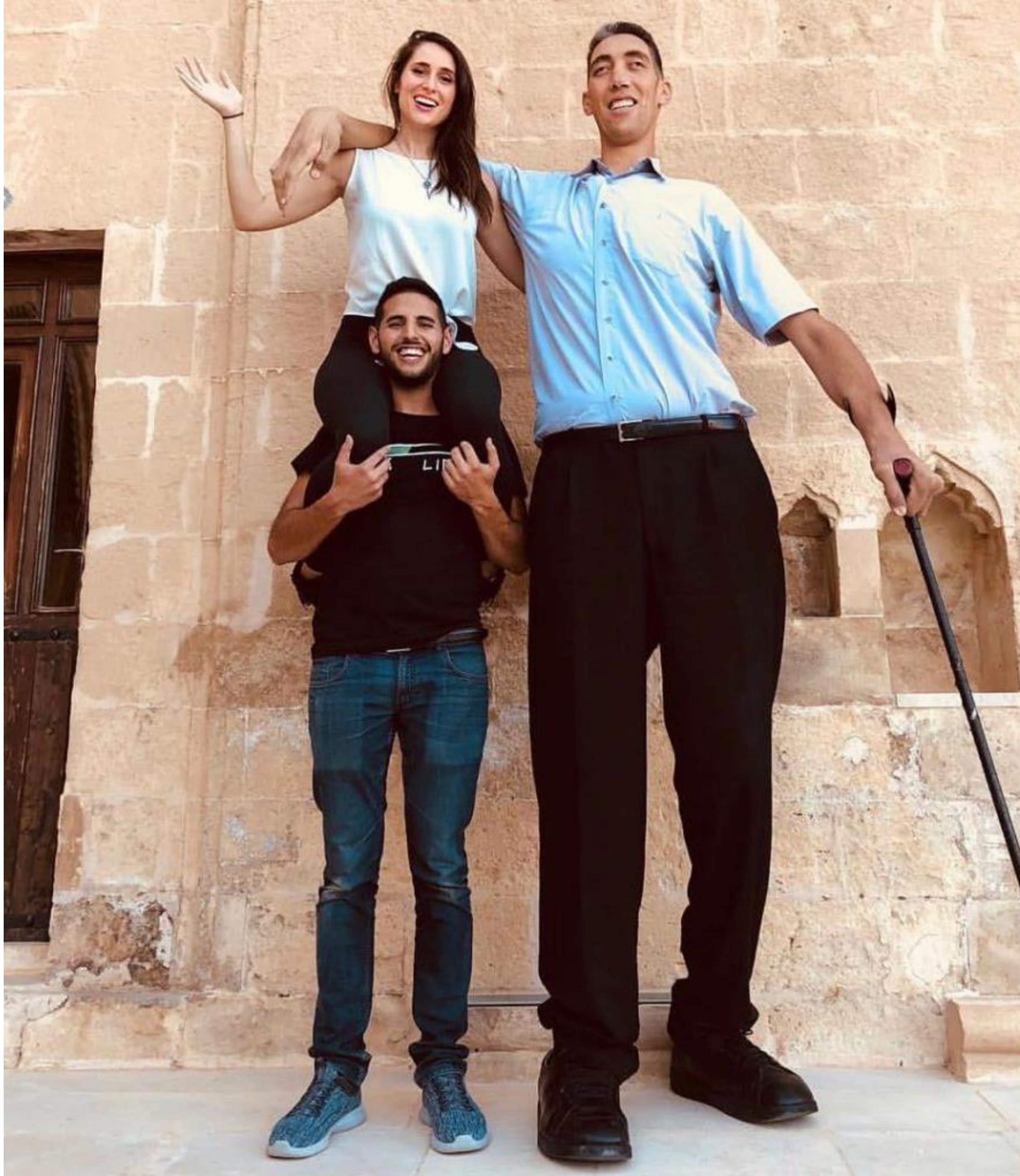
Sultan Kösen b. 1982